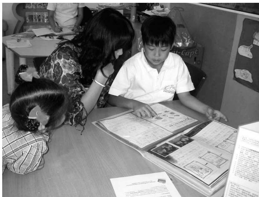
Younger sister attends brother's parent conference

The prime objective of assessment in the PYP is to provide feedback on the learning process. Bruner states that students should receive feedback “not as a reward or punishment, but as information” (Bruner 1961: 26). Teachers need to select assessment strategies and design assessment instruments to reflect clearly the particular learning outcomes on which they intend to report. They need to employ a range of strategies for assessing student work that take into account the diverse, complicated and sophisticated ways that individual students use to understand their experiences. Additionally, the PYP stresses the importance of both student and teacher self-assessment and reflection (examples 14 and 15).