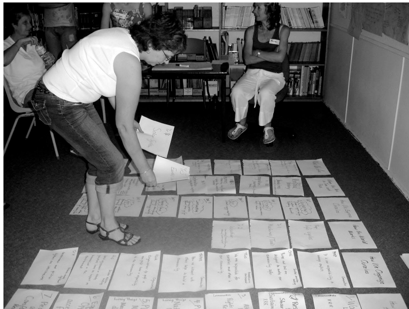
Teachers negotiate placement of units in programme of inquiry

refining a complete programme of inquiry. The proposed units of inquiry at each year level need to be articulated from one year to another. This will ensure a robust programme of inquiry that provides students with experiences that are coherent and connected throughout their time in school (examples 11 and 12).