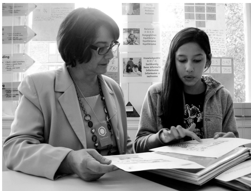
Student discusses exhibition portfolio with mentor

In the final year of the PYP the students participate in a culminating project, the PYP exhibition. This requires that each student demonstrates engagement with the five essential elements of the programme—knowledge, skills, concepts, attitudes, action. It is both a transdisciplinary inquiry conducted in the spirit of personal and shared responsibility, as well as a summative assessment activity that is a celebration and rite of passage, symbolic and actual, from the PYP into the middle years of schooling (example 16).