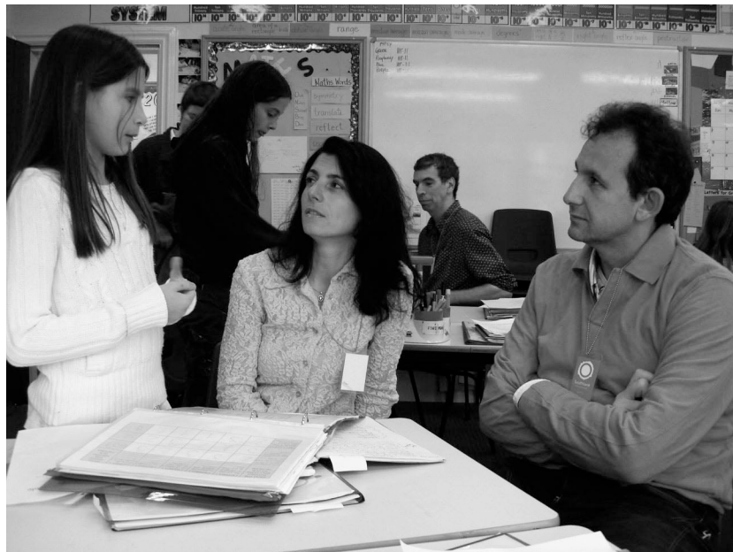
Several student-led conferences take place in classroom

Student-led conferences in a school with a very diverse population provide the opportunity for students to guide their parents or guardians through their recent “journey of learning”, using their mother tongue. Conference tables set up in each classroom are prepared with laminated question prompts translated into multiple languages, for the parents to refer to. The students take their parents or guardians to the tables, where they explain the objectives of the conference: to highlight their “journey of learning”, their personal growth, their challenges and their achievements. The students guide the adults through the contents of their portfolios, discussing the objectives of each included item and indicating their successes and room for growth. Each student has a “personal target sheet” to fill out as they reflect on successes and challenges. Teachers are present but stand apart from the conferences. As they guide the parents or guardians from room to room, the students have a “passport” to be signed by all teachers, to ensure that their development relevant to all areas of the curriculum is discussed.