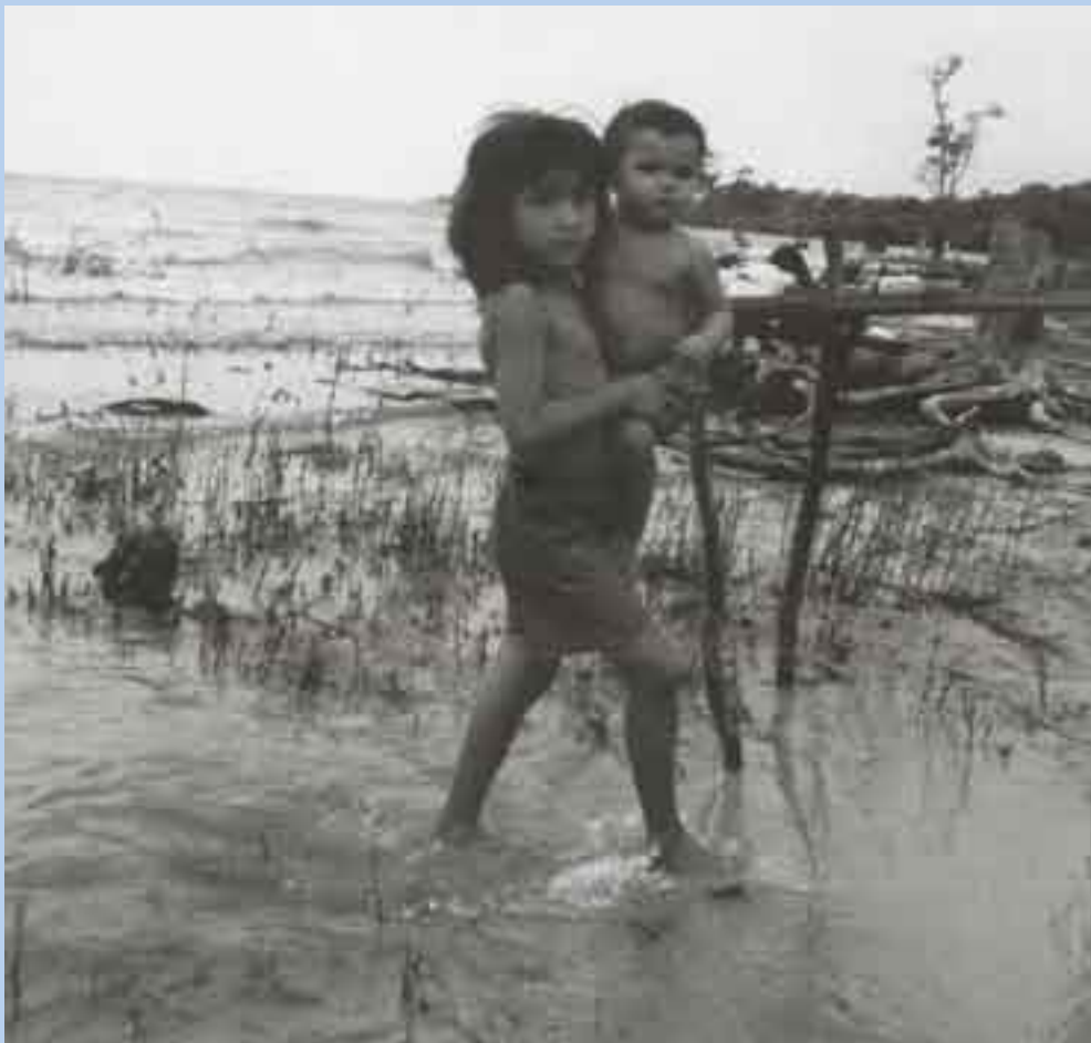
Girls from low-income families throughout the world, like this seven year old in Brazil, work from a very early age looking after children.