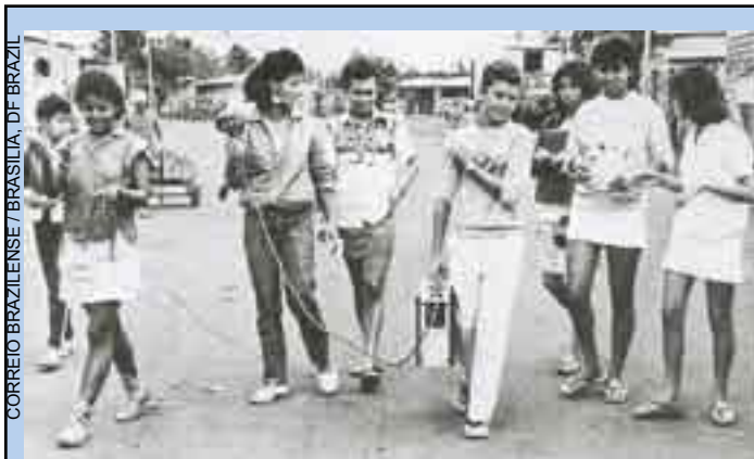
Teenagers in Paranoá, a low-income settlement outside Brasília, using a video system to document community problems as part of their school curriculum.

When I began to develop applied research on the quality of children’s environments and ways to improve them, it became clear to me that there were other reasons, beyond validity of the data, why children’s participation in research was important. In most cities, people, particularly in poor communities, are not involved in decisions concerning their environment, even in such obvious settings as public open space. My training had previously led me to believe that careful