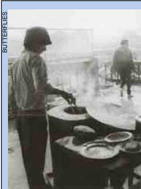
A youth working at Butterflies Restaurant located near the Inter-State Bus Terminals in New Delhi, India. Butterflies, a nongovernmental organization devoted to the lives of street and working children, founded this restaurant as a training centre, source of income, and home for a small number of homeless children and teenagers. At the same time, these young people serve other street children on a regular basis at a 40 per cent discount. A large sign on the front of the restaurant reads, "Managed by Street Children". Not surprisingly, the boys feared this would deter customers but they concluded that they need not hide their identity and the restaurant is surviving. There are hopes of extending the programme to a 'Meals on Wheels' for street children, also managed by street children.

Probably more important than the national events themselves, are the local organizations they have helped inspire. The local committees for street and working children, which are found throughout Brazil, offer opportunities for dialogue between the children, government agencies, and nongovernmental organizations (NGOs). There has been a steadily grow-