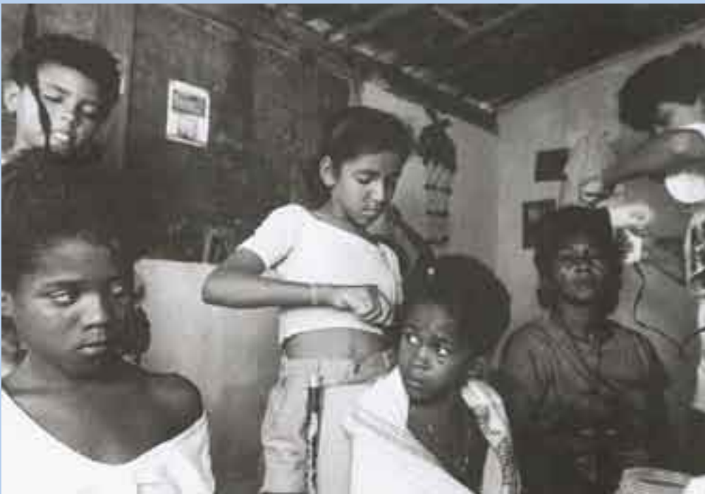
THE PASSAGE HOUSE, RECIFE, BRAZIL

Opportunities for meaningful work can serve as valuable preventative programmes for children living in families and communities where the risk of their turning to the streets is high. In this photograph from Recife, Brazil a woman has been given a small amount of money for equipment and supplies to run a hairdressing programme for girls. She also uses this opportunity to discuss health, AIDS, prostitution, schooling, and work in small informal discussion groups. The Passage House, which developed this programme, also manages homes for prostitute girls emphasizing a high degree of participation by the girls in projects designed to improve the lives of other prostitute girls.